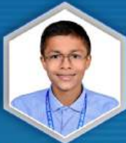
Dungarwal Mit N. 87.06% (FYCE)