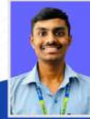
WAGH OM S.