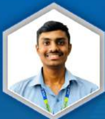
Wagh Om S. 87.8% (TYCE)